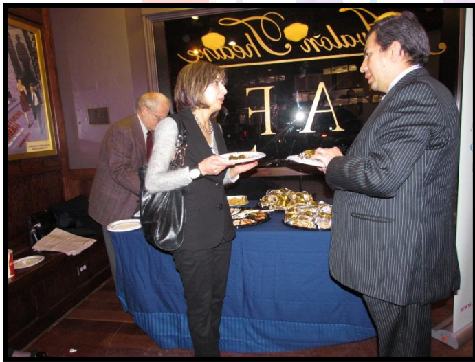
Patrons eat Turkish food from at a VIP reception preceding the screening of The Refugee