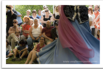
Textile Museum Festival 2011

The Karabakh Foundation, established in 2010, is a charitable non-profit, tax-exempt organization under Section 501(c)(3) of the U.S. Internal Revenue Code that aims to research, study, publish, educate and present the Azerbaijani and Caucasus region's history, focusing especially on the Karabakh region of Azerbaijan, as well as Azerbaijani culture, language, traditions, arts, cuisine, music, architecture, literature, important historical figures, and initiatives on conflict resolution pertaining to the Karabakh region of Azerbaijan.